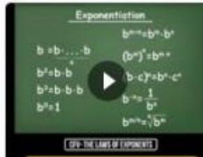
CFV-The Laws of Exp...