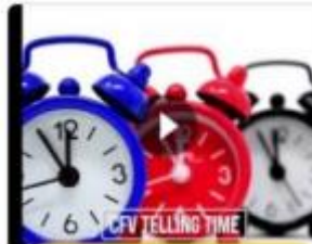
CFV Telling Time.mov