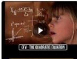
CFV-The Quadratic E...