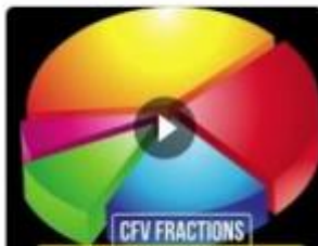
CFV Fractions Jingle....