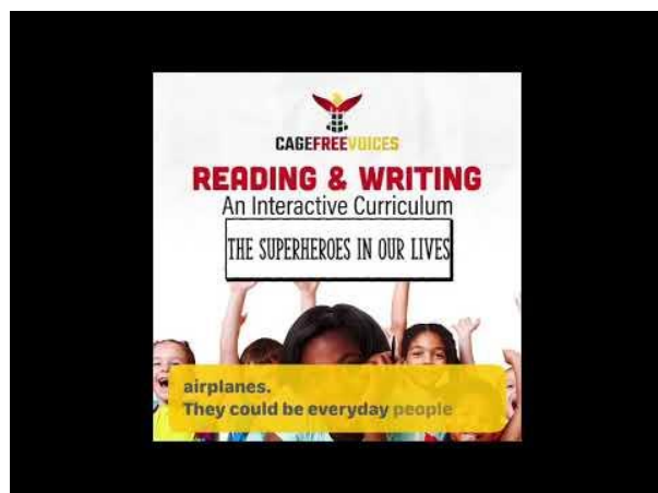
“The Superheroes in Our Lives” -Bathsheba Smithen